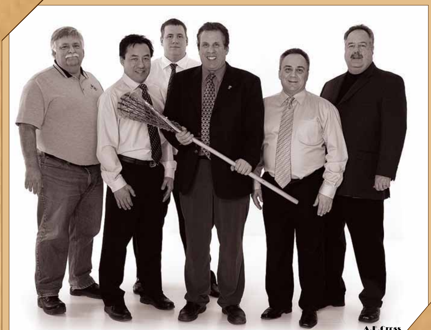
LETHBRIDGE LACROSSE ASSOCIATION PIONEERS LACROSSE