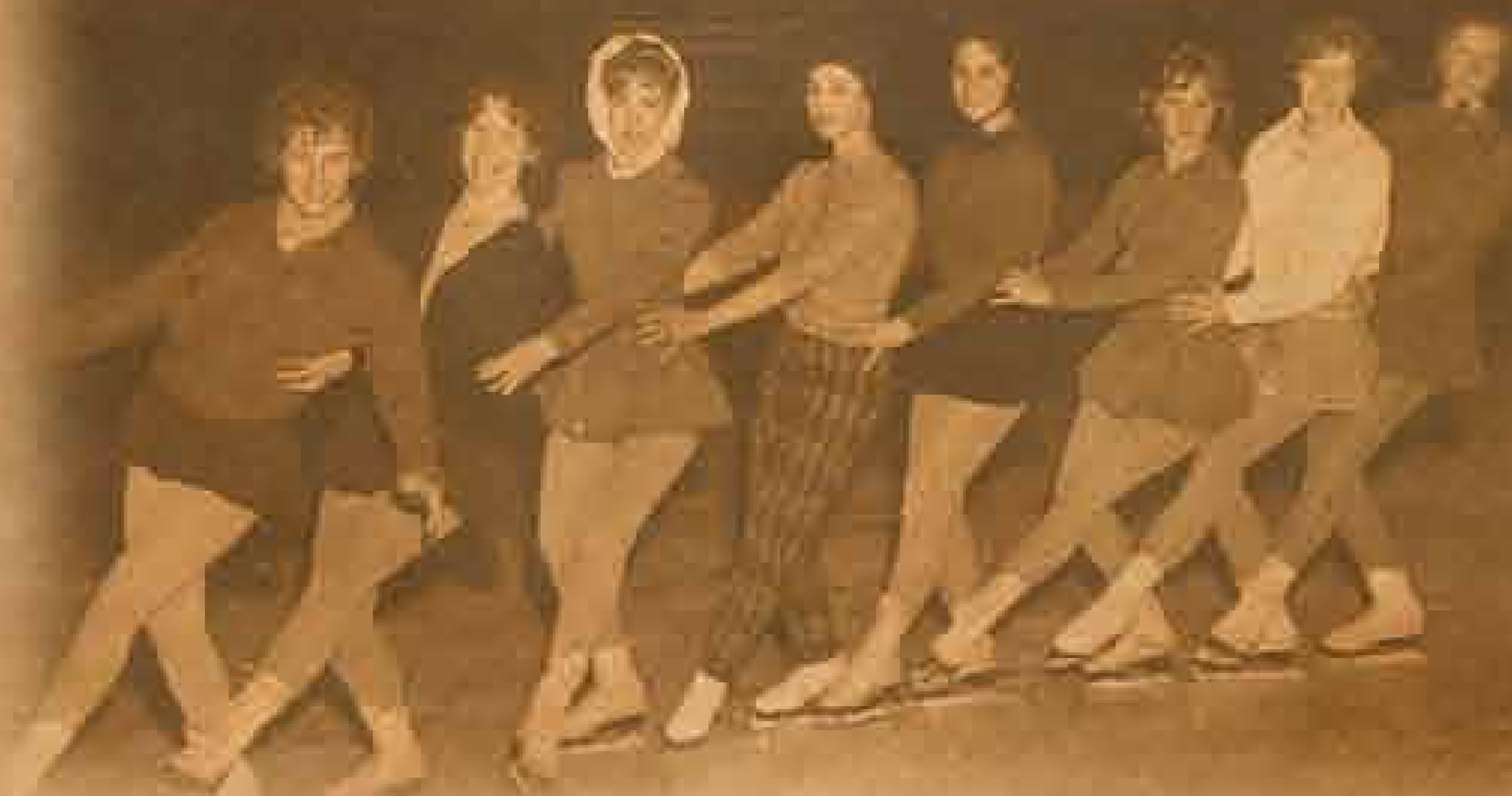
1961 Lethbridge Figure Skating Club